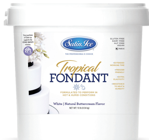
10lb (4.54 kg) Pail 4 PER CASE