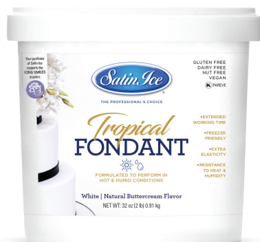
2lb (.91 kg) Pail 10 PER CASE